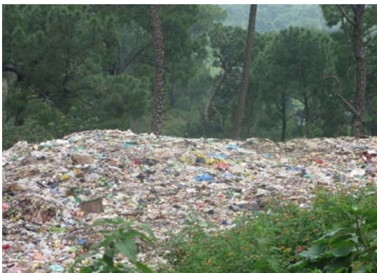
Photograph of the Site

This case deals with the issue of environmental pollution. The Municipal Corporation of Dharamshala has made a solid waste management station on Chadi Road near the HRTC workshop. However, it is not being managed properly. Solid waste has been discarded without appropriate treatment. The entire waste solid is thrown from Dharamshala on a village below in the mountains. A small gorge of running water is also near this location. The polluted water from this gorge has made