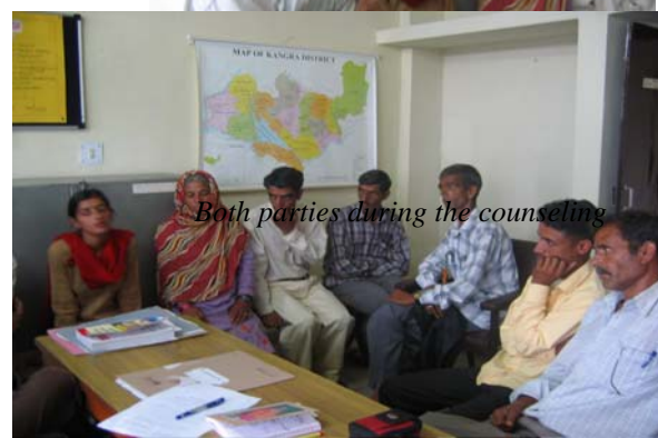
Both parties during the counseling