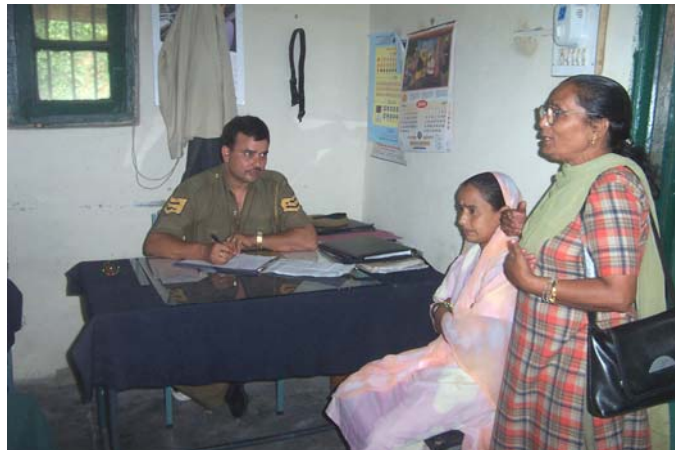
A victim is being facilitated by CORD Worker at Police state

There have been 414 cases registered and 264 cases resolved up until now with the help of CORD's network. If there is no possibility of resolving the case on the local level through Mahila Mandal & Panchayats (depending on the nature of cases), because it is speedy and cheap) then only does CORD try to resolve the cases through other intuitions i.e. the Human Rights Law Network (HRLN), the police, the Women's Cell, the court, etc. Most cases are referred by Mahila Mandals and other community based organizations. CORD provides victims with para-legal aid and counseling.